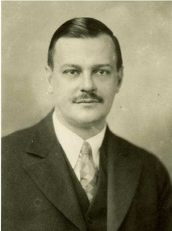
Clarence Cook Little (1925-1929)

In the aftermath of Burton's tragic death, the regents searched for a young man in vigorous health and turned to the 36-year-old president of the University of Maine, Clarence Cook (Pete) Little, as Michigan's next president. A cancer researcher with all of his degrees from Harvard, Little favored the Michigan focus on research, but he clung to the New England collegiate ideal of a selective student body with an emphasis on character development rather than preparation for a career. In effect, he pushed the Harvard educational model, complete with the Harvard "houses" instead of students living independently in boarding houses and fraternities, along with a common curriculum for the first two years through a "university college," much to the dismay and determined resistance of the Michigan faculty. These educational objectives, coupled with his controversial stand on social issues such as prohibition and birth control, soon created strained relations both on the campus and across the state. Although Fielding Yost, now athletic director, managed to build Michigan Stadium during Little's tenure, other accomplishments were modest, and after only four years he submitted his resignation in 1929 to become director of the Jackson Memorial Laboratory in Bar Harbor, Maine. The regents were faced once again with finding a new president, for the third time in the decade.