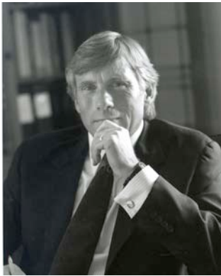
Lee C. Bollinger (1997-2001)