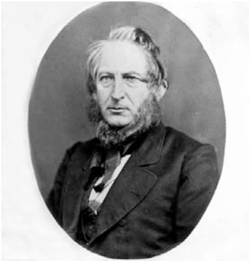
Henry Philip Tappan (1852-1863)

Of course, while university presidents are most successful when they understand and respect the institutional saga of their university, they are also capable of shaping it to some extent. But perhaps more significantly, the long history and unusually strong traditions characterizing universities such as the University of Michigan inform, define, and shape their leadership. It has sometimes been suggested that the regents of the university have been fortunate to have always selected the right leader for the times. Yet history suggests the achievements of Michigan's presidents has been due less to good fortune or wisdom in their selection than to the ability of this remarkable institution to mold its leadership. For this tradition all should be grateful, since change inevitably happens in both rapid and unexpected ways in higher education, as evidenced by the diverse roles that the university's presidents have played over time.