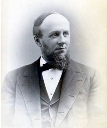
James Burrill Angell (1871-1909)

Michigan's longest serving president (38 years), James Angell, had served as president of the University of Vermont and on the faculty of Brown University before coming to Ann Arbor. He presided over Michigan's growth into the largest university in the nation. He was persuasive both with the regents and the state legislature. He managed to convince the state to fund the university through a "mill tax," a fixed percentage of the state property tax, thereby avoiding the politics of having to beg the legislature each year for an operating appropriation (as is the practice today).